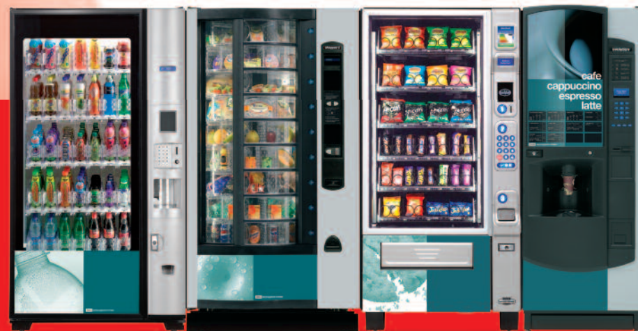
Image shows BevMax 4 35 select, Shopper 2, Merchant 4 & Evolution. Base graphics shown on Merchant and Evolution are available as extra cost options.

Place the Evolution with cold drink, snack, and combination machines from the Crane Merchandising Systems range to create a total vending solution tailored to the needs of specific staff/customer preference or location.